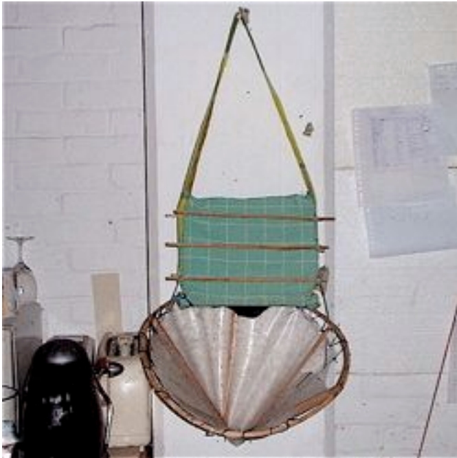
Work at the Demotech Lab in the Netherlands continued with a search for the finishing touch: a basin to collect the spill water and the drain to get it out of the way.